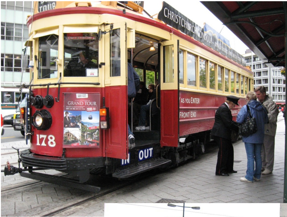
Left and below: Some of the trams in Christchurch