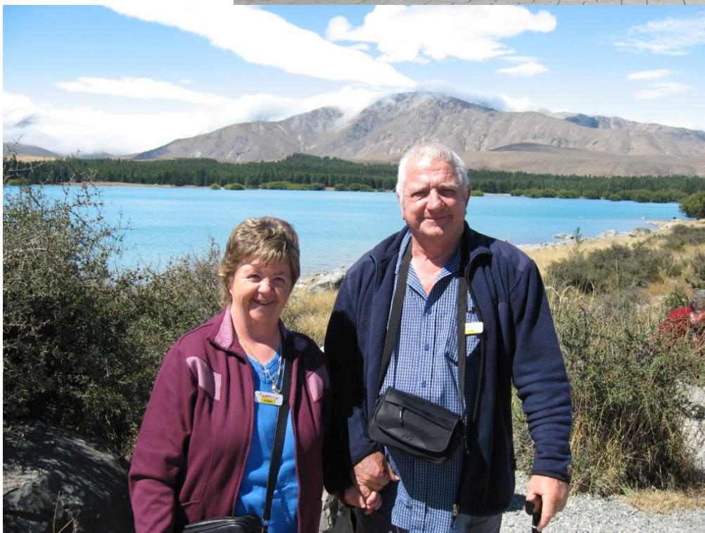
Left: Lovely scenery but these two just kept sticking their faces in all the photos.

More photos in “Viv’s Happy Snaps” in the member’s gallery